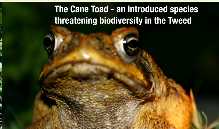
The Cane Toad - an introduced species threatening biodiversity in the Tweed