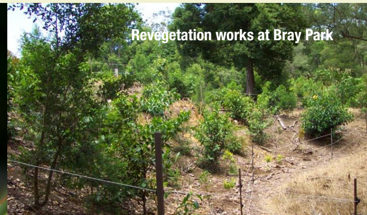
Revegetation works at Bray Park